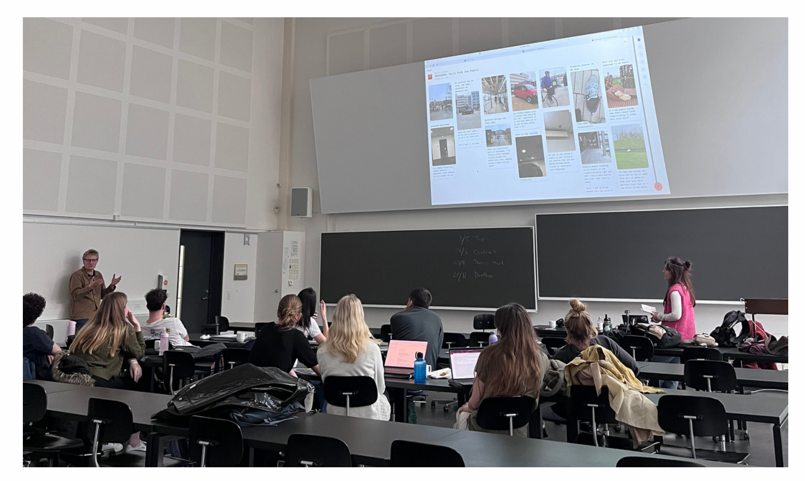
Workshop on visual ethnographical methods

A big thank you to everyone involved for your feedback and collaborative thinking. We're looking forward to continuing the research!