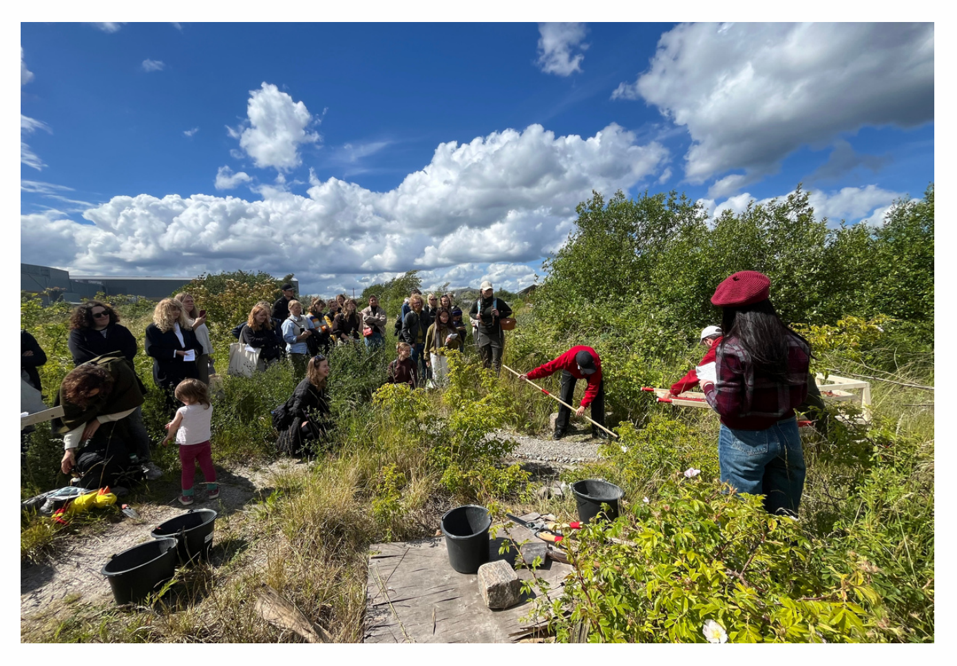
Vernissage of the urban interventions