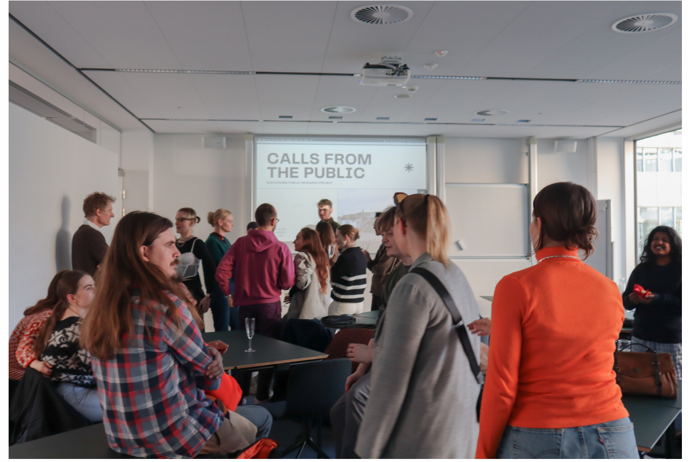
Kick-off meeting for Calls from the Public

Co-directed picture as part of the testing of visual methods