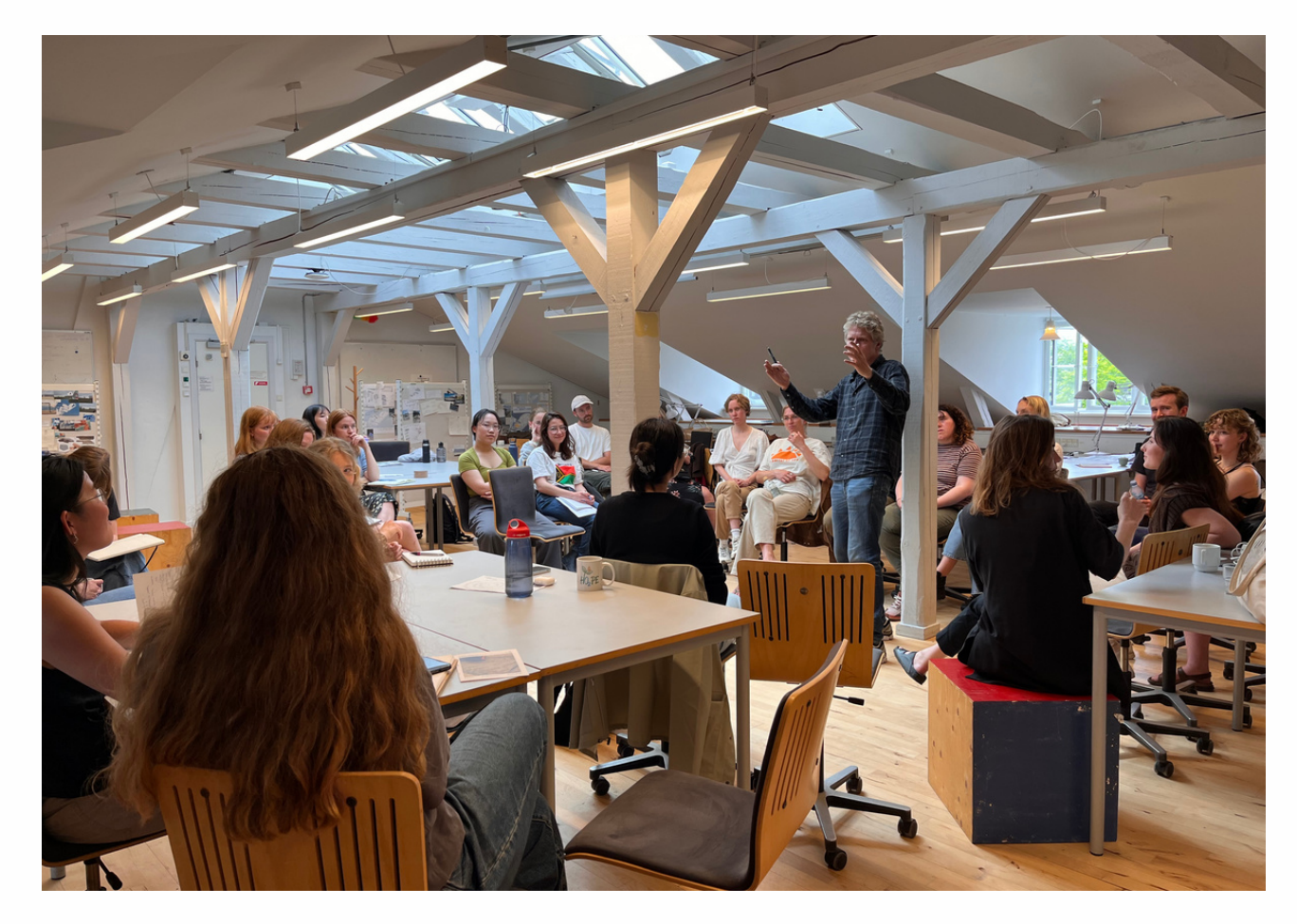
Workshop with the UIS on using ethnographic methods to turn abstract ideas into concrete design solutions

As summer arrives, we have dived head-first into the analysis and coding of the data we are receiving from our method "Calls from the Public". A big thank you to everyone collaborating and sending messages – we are eagerly looking forward to the interviews to come in the next months!